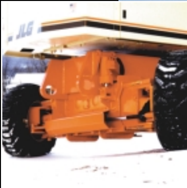
Oscillating Axle for Uneven Terrain