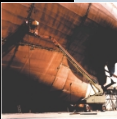
Proven Performance and Reliability