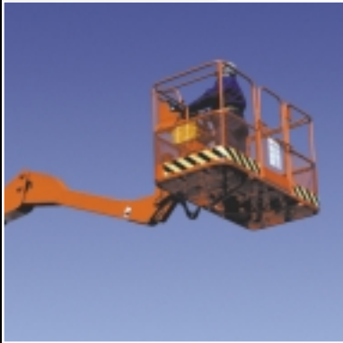
Extend-A-Reach for Added Versatility